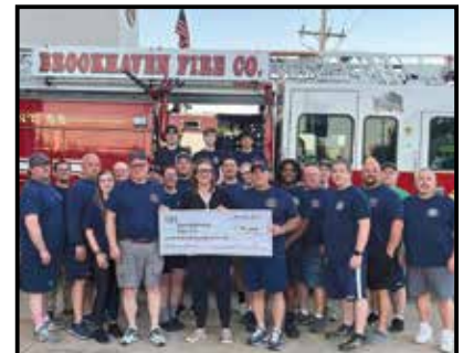
Presenting a $75,000 state grant to Brookhaven Fire Co. Station 52 to help pay for a new garage to house its third ambulance.