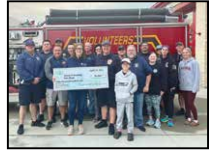
Presenting a $50,000 state grant to Aston Township Fire Department for protective gear.