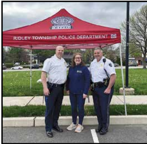
Thank you to Ridley Township Police for partnering with me this spring to help residents get their damaged or worn license plates replaced at no cost.