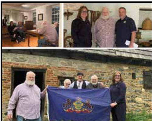
I visited the Caleb Pusey House in Upland Borough and met with some of their volunteer board members. I enjoy learning about the rich history we have in Delco.