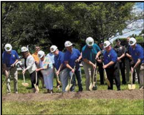
I joined Aston Township officials and police officers in June to break ground for their new township building and police department.