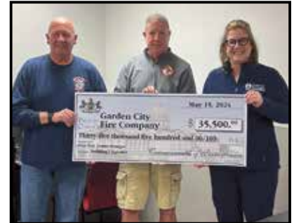
Presenting a $35,500 state grant to Garden City Fire Company #1 to help complete their new pole barn.