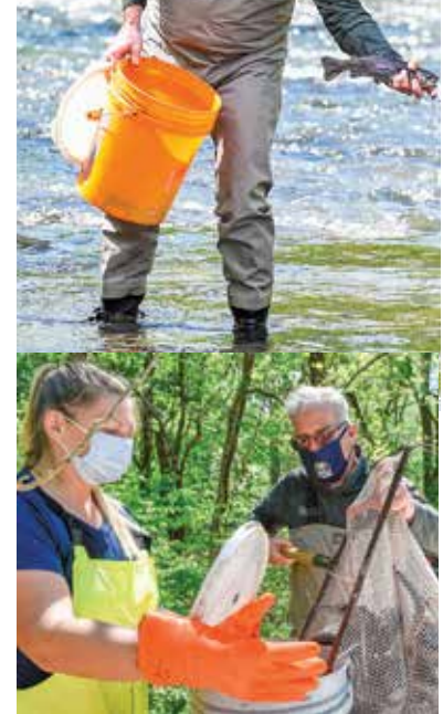
Annual trout restocking in the waters of Pennypack Creek.

recent past, participants in over 60 different service organizations and hundreds of unique one-day fishing events across the Commonwealth would have qualified for a therapeutic license exemption, if it had existed.