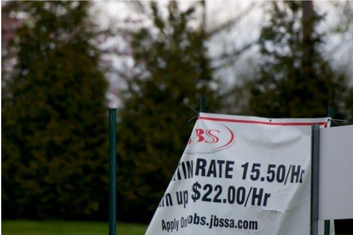
A sign outside the JBS plant in Souderton, Penn., advertising jobs.

Our work is essential to feeding the nation, yet plants like mine have become hot spots for the virus. On Tuesday, President Trump said that he would declare meat processing plants “critical infrastructure” to avoid a shortage in the supply chain. Already, thousands of meatpacking workers across the country have become sick at work.